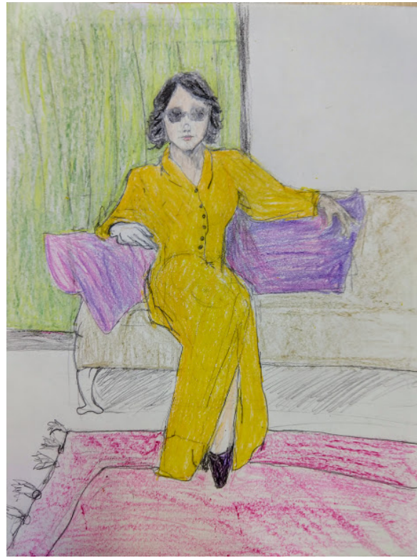
WILLIAM MERRITT CHASE, (American, 1849–1916), A Comfortable Corner (At Her Ease; The Blue Kimono [sic]; The Blue Kimono), ca. 1888, Oil on canvas, 57 x 44 1/2 inches, Parrish Art Museum, Water Mill, N.Y., Littlejohn Collection; Parrish Art Museum, Water Mill, NY, 1961.5.21