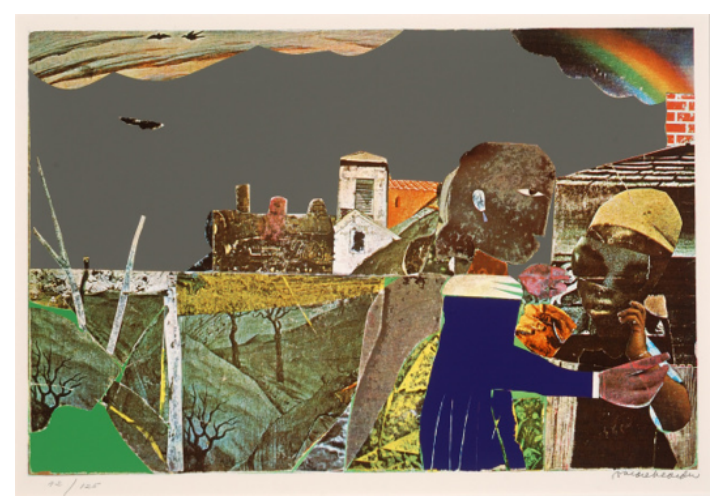
Romare Bearden (American, 1911–1988) Tidings, ca. 1970s Silkscreen 22 1/16 x 29 1/8 inches Parrish Art Museum, Water Mill, NY Gift of Argosy Partners & Bond Street Partners