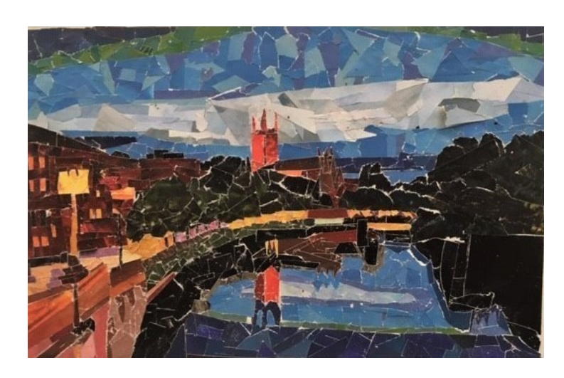
An example from the Student Exhibition Made by Luna Paucar of Bridgehampton School

Replicate an image from the Parrish collection in paper collage!