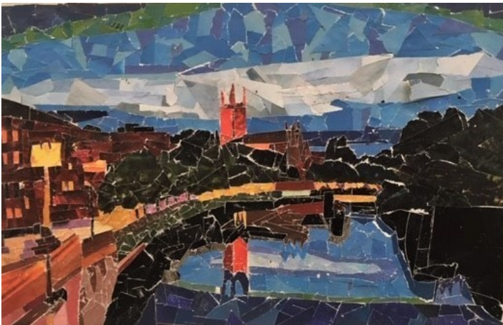
An example from the Student Exhibition Made by Luna Paucar of Bridgehampton School

Replicate an image from the Parrish collection in paper collage!