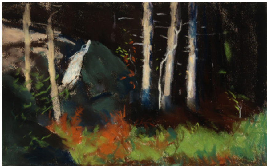
Robert Henri (American, 1865-1929) At the Place of the Three Trees, 1918 Pastel on paper 20 1/8 x 27 5/8 inches Parrish Art Museum, Water Mill, NY Museum Purchase, Friends of the Collection Fund 1987.6