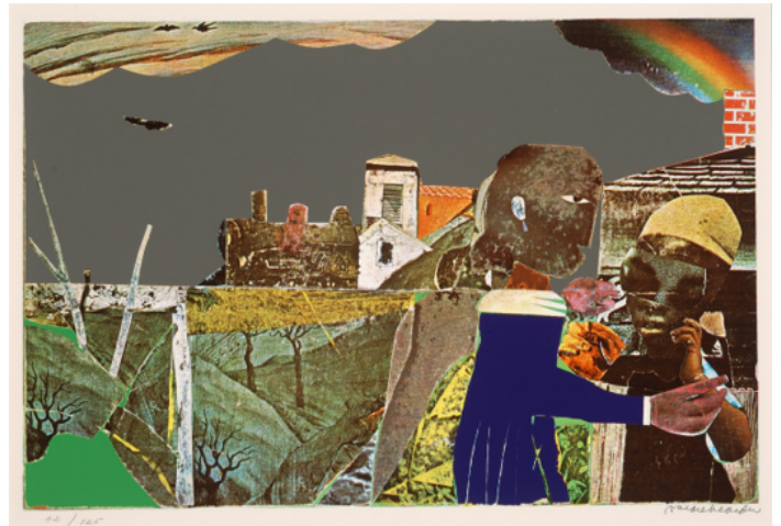
Romare Bearden (American, 1911–1988) Tidings , ca. 1970s Silkscreen 22 1/16 x 29 1/8 inches Parrish Art Museum, Water Mill, NY Gift of Argosy Partners & Bond Street Partners