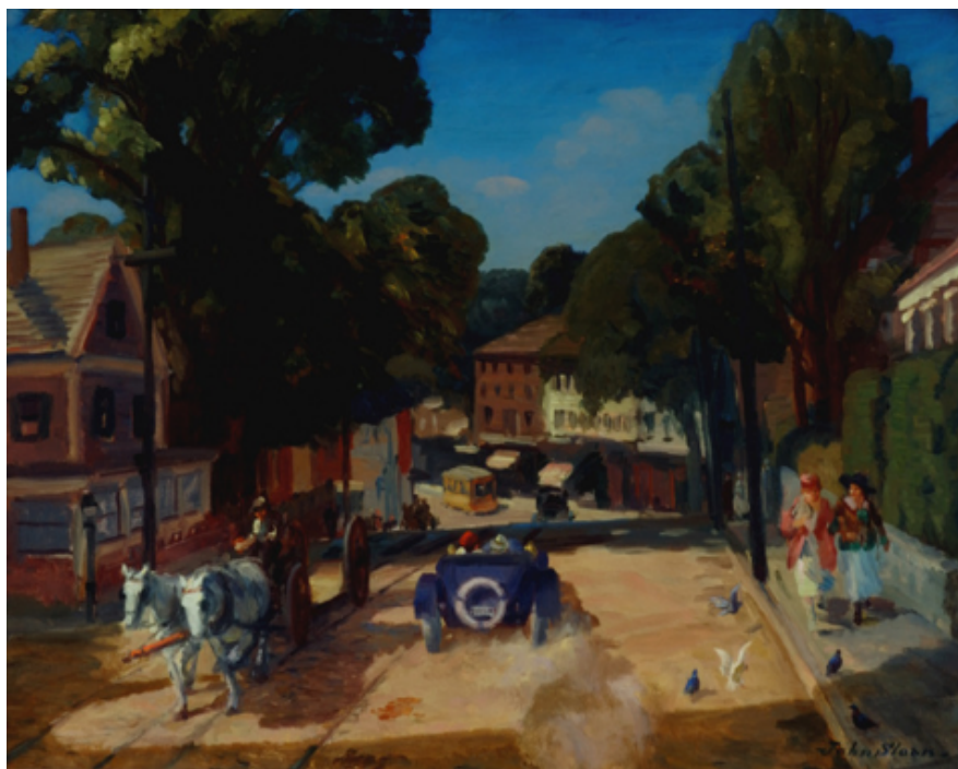
John Sloan (American, 1871-1951) Hill, Main Street, Gloucester, ca. 1916 Oil on canvas 25 3/4 x 31 5/8 inches Parrish Art Museum, Water Mill, NY Littlejohn Collection 1961.3.208

Here are a couple of suggestions to get you started: