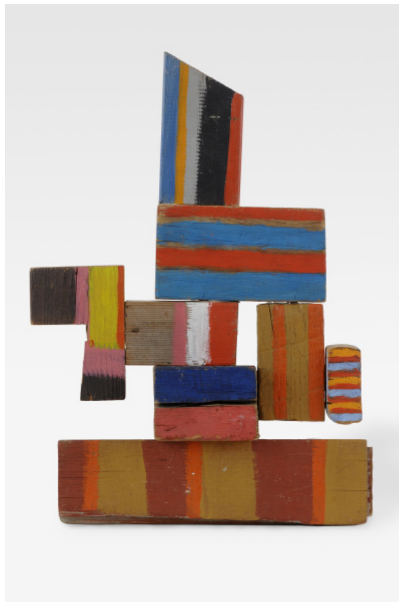
Betty Parsons, American (1900-1982), Pulling That Way, 1982, Acrylic on wood 26 x 19 x 3 inches, Parrish Art Museum, Water Mill, N.Y., Gift of the Robert Rauschenberg Foundation, 2012.33.4

Betty Parsons was an artist and gallerist whose contributions to the New York art scene were instrumental to the development of American art. She was hailed as the “den mother of the abstract expressionists” since she was a proponent of their work and featured them prominently in her midtown gallery.