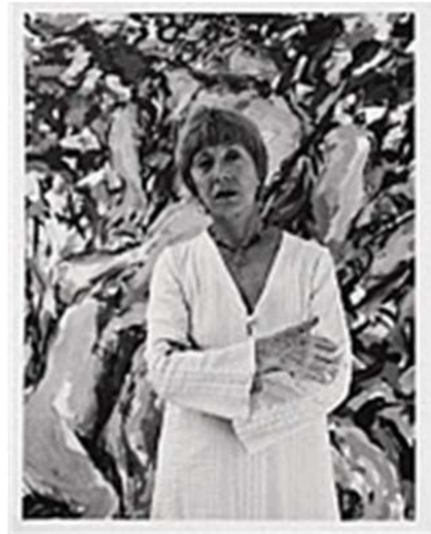
Anne Sager, Elaine DeKooning, ca. 1980

Untitled, ca. 1980 Gelatin silver print 5 1/2 x 4 7/8 inches