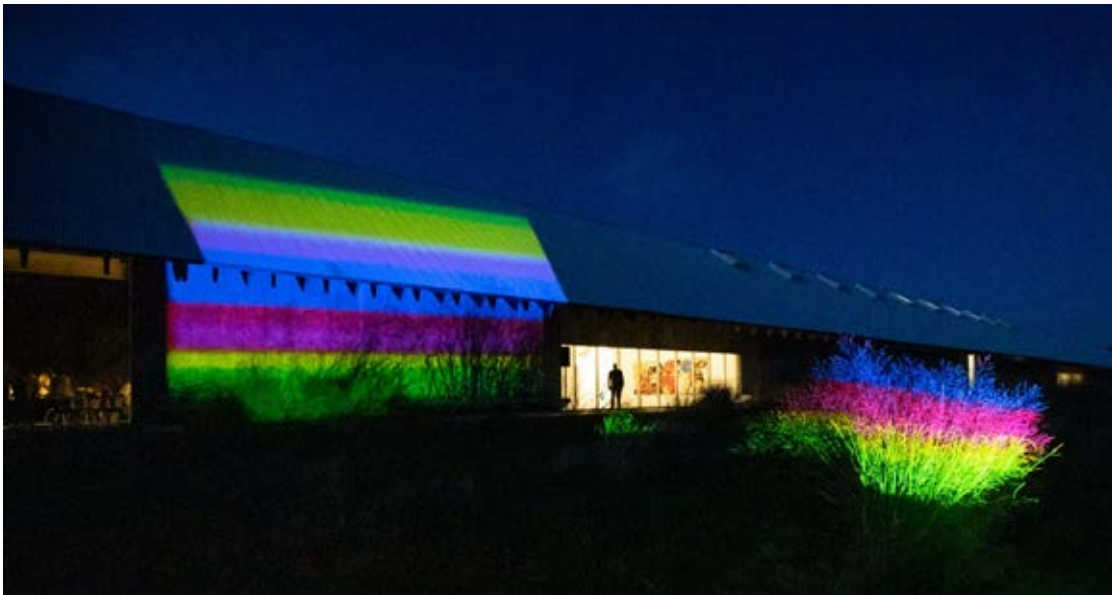
Optosonic Echoes live performance at the Parrish Art Museum.