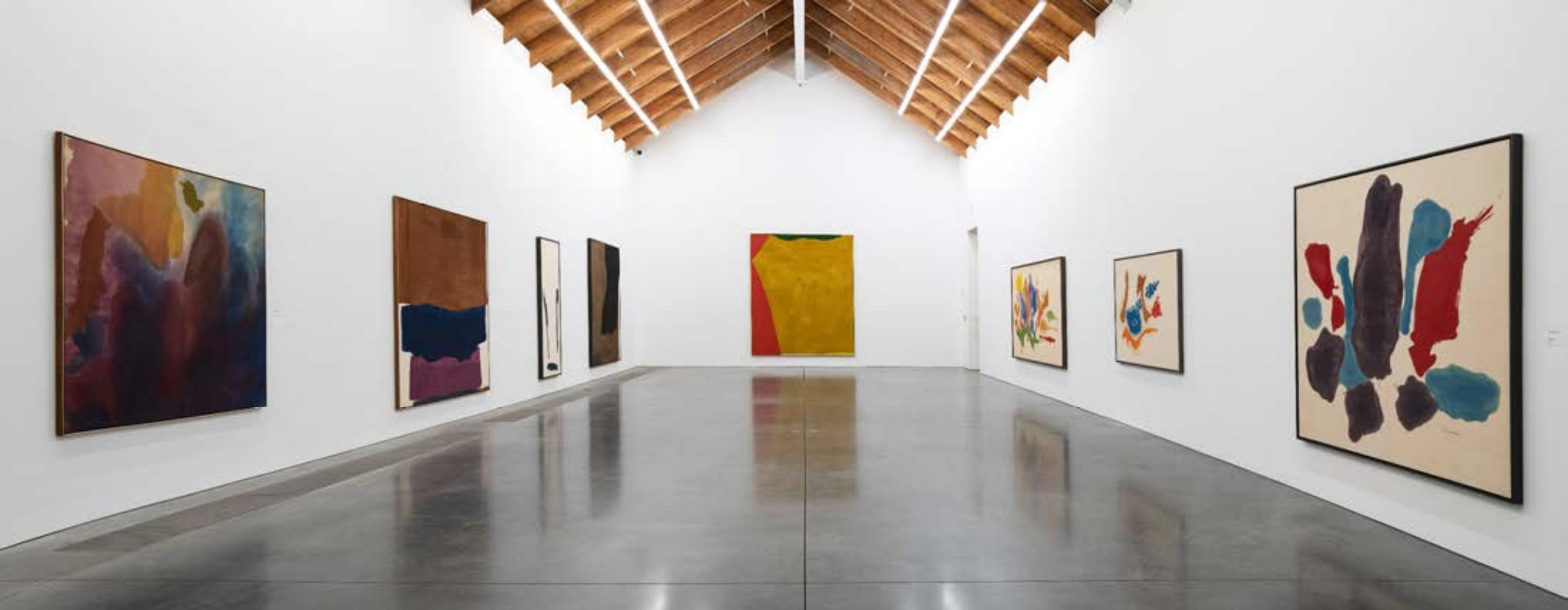
Abstract Climates: Helen Frankenthaler In Provincetown. Installation view.