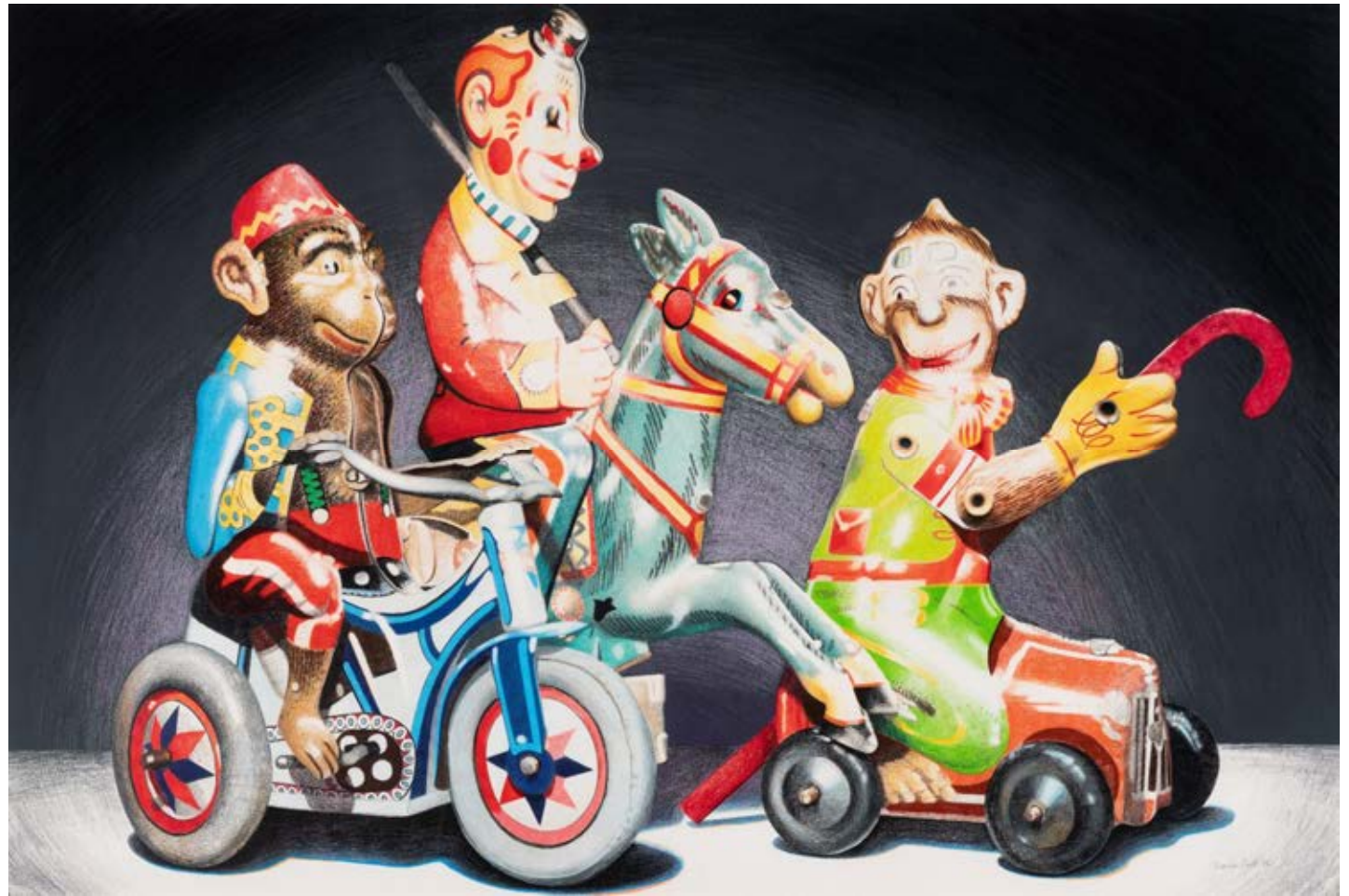
Charles Bell, Before the Journey , 1986