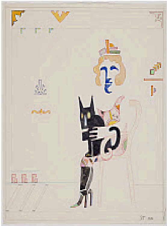
Saul Steinberg, Untitled, 1970

Easel, 1968 Ink and crayon on F.J. Head handmade paper 18 x 23 inches