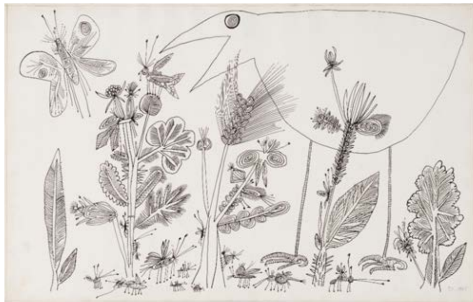
Saul Steinberg (American, born Romania, 1914–1999), Birds and Insects , 1945. Ink and pencil on paper (Strathmore). Gift of the Saul Steinberg Foundation. © 2020 Saul Steinberg Foundation/Artists Rights Society (ARS), New York

We are grateful for everyone who supported the Museum in 2019—Our program and education funders and supporters of benefit events like the Midsummer Party, our dedicated, enthusiastic staff and Board of Trustees, more than 4,173 loyal Members, and over 61,000 visitors to the Museum and its programs. This participation validates the Mission of the Parrish and encourages us to continue to serve the community near and far.