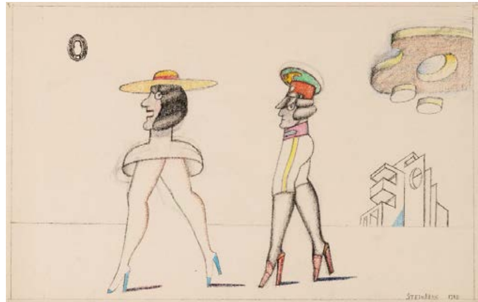
Saul Steinberg, Untitled, 1980

Untitled, 1987 Crayon, colored pencil, and pencil on sketchbook paper 11 x 14 inches