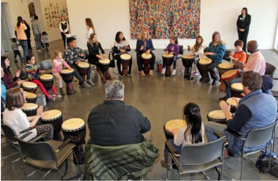
Drumming Circle during 2019 Community Day at the Museum.