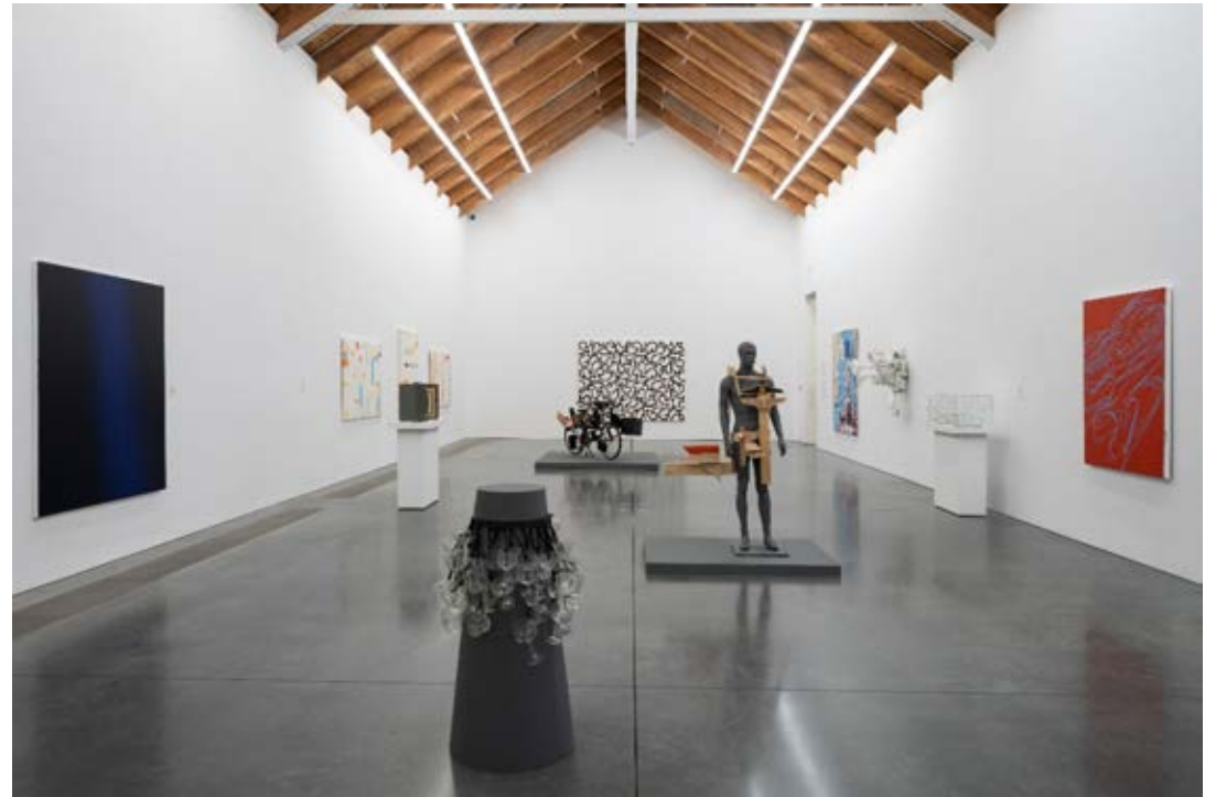
Artists Choose Artists. Installation view.