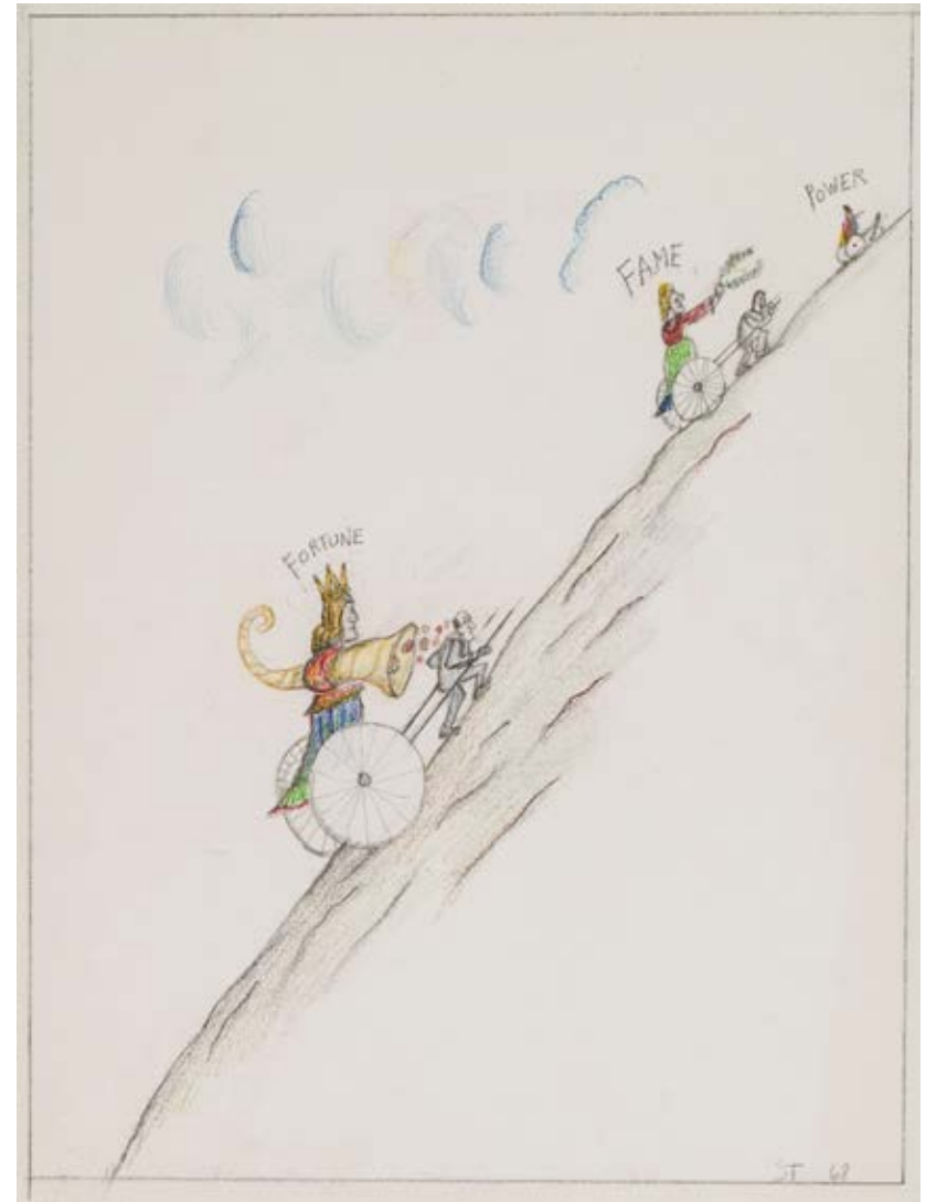
Saul Steinberg, Untitled, 1968

Untitled, 1970 1975 Multicolored wool thread on embroidery canvas 17 1/4 x 23 1/4 inches