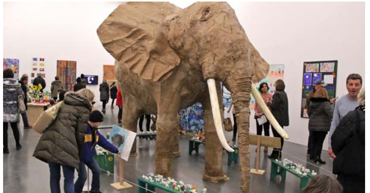
2019 Student Exhibition, Installation view, High School and Middle/Elementary School galleries.