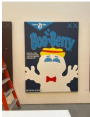
KAWS [NOT.YET.TITLED?BOO.BERRY.LIMITED] 80 x 60 x 1.5 inches (16192)