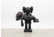
KAWS GONE, 2020 Bronze, paint 71.25 x 71.5 x 31.125 inches AP1, Edition of 1, with 1 AP (8677)