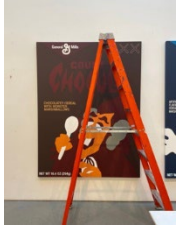
KAWS [NOT.YET.TITLED?COUNT.CHOCULA.LIMITED] 80 x 60 x 1.5 inches (16195)