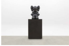
KAWS WATCHING, 2021 Bronze 73.25 x 29.5 x 33.5 inches AP1, Edition of 1, with 1AP (14226)