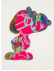
KAWS FIVE.SUSPECTS.(-THREE), 2016 Acrylic on canvas 84 x 73 inches (3474)