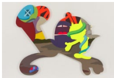
KAWS TAKE.THE.CURE, 2013 Acrylic on canvas 97 x 120 inches (2829)