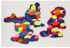
KAWS PASS.THE.BLAME, 2013 Acrylic on canvas Part 1: 120 H. x 120 W. inches Part 2: 90 H. x 76 W. inches (2824)