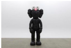
KAWS BFF, 2016 Bronze, paint 96 x 40.6 x 24.7 inches AP1, Edition of 1, with 1 AP (4402)