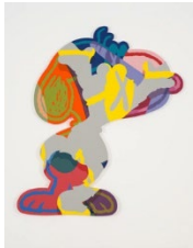
KAWS FIVE.SUSPECTS.(–ONE), 2016 Acrylic on canvas 84 x 73 inches (3471)