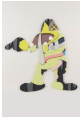
KAWS POINT.OF.DISORDER, 2013 Acrylic on canvas 120 x 116 inches (2826)