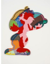
KAWS FIVE.SUSPECTS.(-FIVE), 2016 Acrylic on canvas 84 x 73 inches (3475)