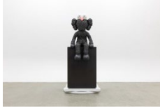
KAWS SEEING, 2021 Bronze, paint 75.5 x 29.5 x 39.75 inches AP1, Edition of 1, with 1AP (14227)