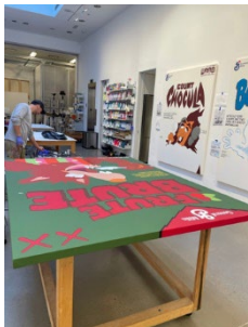
KAWS [NOT.YET.TITLED?FRUTE.BRUTE.LIMITED] 80 x 60 x 1.5 inches (16193)