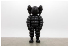
KAWS WHAT.PARTY, 2018 Bronze 90 x 43 x 36 inches AP1, Edition of 5, with 2 APs (6345)