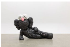
KAWS TIME.OFF, 2021 Bronze, paint 45.75 x 71.875 x 37.625 inches AP1, Edition of 3, with 2AP (9280)