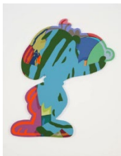
KAWS FIVE.SUSPECTS.(–TWO), 2016 Acrylic on canvas 84 x 73 inches (3472)