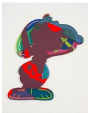
KAWS FIVE.SUSPECTS.(–FOUR), 2016 Acrylic on canvas 84 x 73 inches (3473)