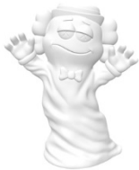
KAWS and General Mills KAWS.BOO.BERRY Bronze Approx 60 x 48.26 x 28.73 inches (#1/3) (16703)