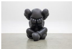
KAWS SEPARATED, 2021 Bronze 47.5 x 41.5 x 39 inches AP1, Edition of 1, with 1AP (14543)