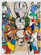
Bfly No. 32, 2023 signed: en recto, TLC Oil, oil stick and acrylic on linen 144 x 108 in 365.8 x 274.3 cm (2023.P.058)