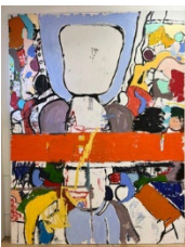
Bfly No. 35, 2023 need detail 144 x 108 in 365.8 x 274.3 cm (2023.P.061)