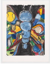
Untitled, 2024 Signed & Dated: en recto, BRC Watercolor inks on Arches En tout Cas paper 57 7/8 x 43 7/8 in 147 x 111.4 cm (2024.E.012)