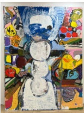
Bfly No. 31, 2023 need detail 144 x 108 in 365.8 x 274.3 cm (2023.P.057)