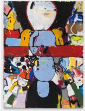
Bfly No. 22, 2023 signed: en recto, TLC oil, acrylic and spray paint on linen 144 x 108 in 365.8 x 274.3 cm (2023.P.016)

Eddie Martinez Bflies , Parrish Art Museum, Watermill, NY – loan period June 15 – October 15, 2024