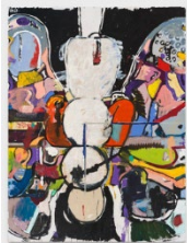
Bfly No. 34, 2023 signed: en recto, TLC Oil, oil stick, acrylic and spray paint on linen 144 x 108 in 365.8 x 274.3 cm (2023.P.060)