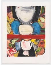
Untitled, 2024 Signed & Dated: en recto, BRC Watercolor inks on Arches En tout Cas paper 57 7/8 x 43 7/8 in 147 x 111.4 cm (2024.E.013)