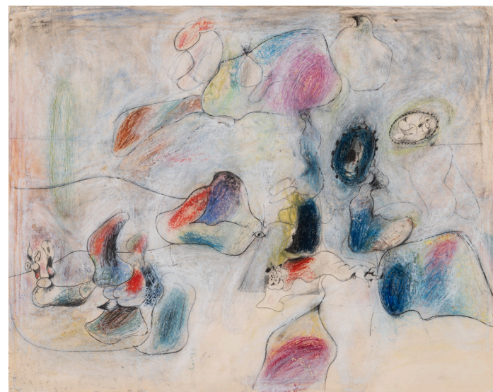
2021 Acquisition Arshile Gorky Untitled , 1943 Crayon with graphite on paper laid on canvas, 23 x 28 3/4 inches Gift of Sandy and Stephen Perlbinde