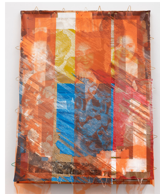
Above: 2021 Acquisition

The Parrish extends special thanks to Hauser & Wirth for their participation and generosity in support of the installation of this project.