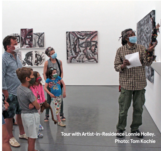
Tour with Artist-in-Residence Lonnie Holley.