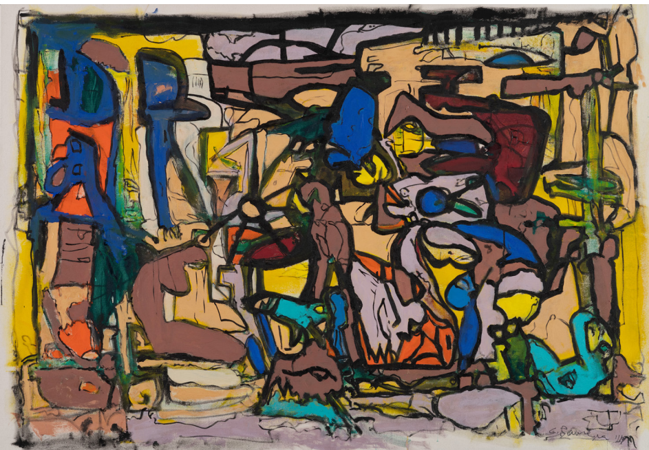
Cover: Martin Creed Work No. 2210, EVERYTHING IS GOING TO BE ALRIGHT (2015) Multicoloured neon, 61 x 2127 1/2 cm / 24 x 837 5/8 inches. Installation view, Parrish Art Museum. Courtesy the artist and Hauser & Wirth. Photo: Thomas Barratt. © Martin Creed. All Rights Reserved, © 2021 Artists Rights Society (ARS), New York / DACS, London. Photo: Gary Mamay