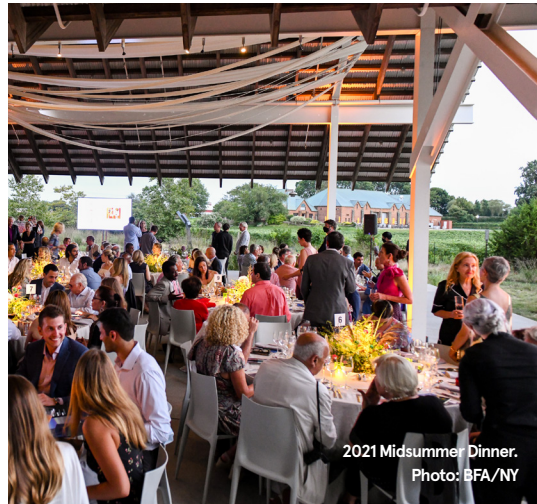
2021 Midsummer Dinner.

With the introduction of vaccines and new safety protocols such as mask wearing, Membership reintroduced in-person programming, tours, and exhibition preview events in April that included eight special tours and events for high-engagement Membership levels that provide unique access to Museum brain trust. Those include Members of the Parrish Contemporary Circle, and Giving Circles (currently named Parrish Circle and Director's Council), who received invitations to private tours with the Museum's Curators and Director, exclusive off-site events, VIP passes to art fairs, and more. The Museum also hosted five Business Member events and three exhibition preview receptions for upper-level Members.