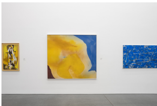
Installation view of Affinities for Abstraction: Women Artists on Eastern Long Island, 1950–2020 .