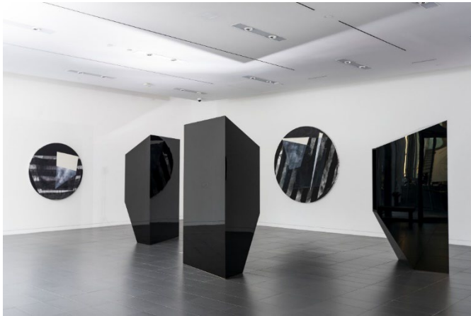
Nautical Dusk , 2018 Installation View