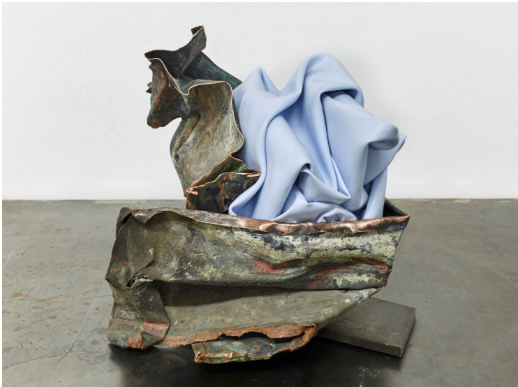
Occupied, 2019 Copper, paint 9.25 x 11 x 9 in.

Occupied , 2019 was included in a solo show ( Highly Worked ) of the artist at Denny Dimin Gallery, New York, N.Y. Crow , 2020 was a part of a solo show at Marco Poggiali Gallery, Milan, Italy titled Because it's in my Blood .