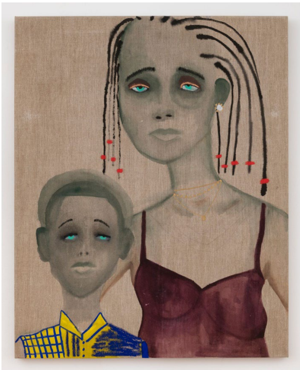
We All Have Choices , 2020 Oil, oil pastel, watercolor and acrylic on linen 40 x 32 in.