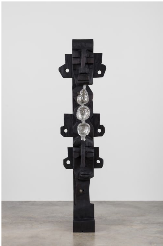
Namasole Nababinge, Mother of King Nakibinge from the Kuchu Royal Family of Buganda, 2021 Wood, wax, aluminum, nails, bolts, nuts and washers 98 3/8 x 26 3/8 x 23 5/8 in.

The works below represent recent sculptures created by the artist. Commenting on the meaning behind her work, she notes, "Both the space and the titles are important to me because the work is basically a reflection on where I come from in the Buganda Kingdom and on creating a queer community."