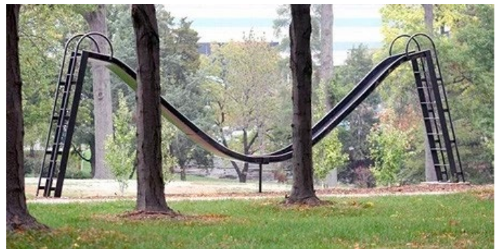
Doubleslide , 2006 Steel 84 x 300 x 24 in.