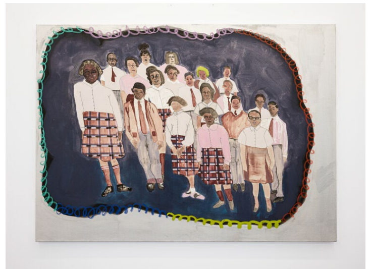
We Didn't Talk Anymore After That Year , 2021 Acrylic, oil pastel, spray paint, charcoal, and graphite on canvas 50 x 70 in.