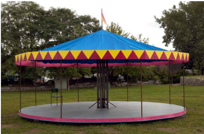
It's not over 'til it's over , 2004 Mixed media 14 x 24 ft (diameter)

In 2022, Olivier will be featured in a group exhibition at ICA Watershed, Boston, MA.