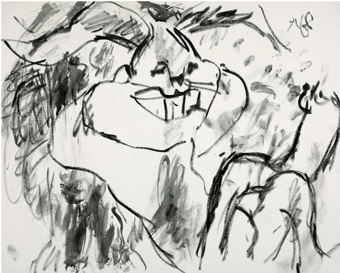
Roy Lichtenstein, Bugs Bunny, c.1958. Brush and india ink on paper, 20 1/8 x 26 1/8 inches (50.9 x 66.3 cm). Private collection. Courtesy of Estate of Roy Lichtenstein.

Roy Lichtenstein: History in the Making, 1940-1960 is the first major museum exhibition to investigate the early work of one of the most celebrated American artists of the 20th century.