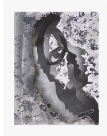
18. Teaching Them To See , 2020 Spray paint and mixed media on paper 24 x 18