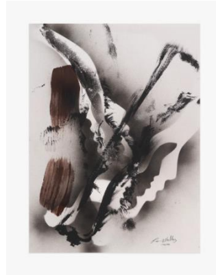
17. Fearing the Particles , 2020 Spray paint and mixed media on paper 24 x 18 Courtesy of the Artist