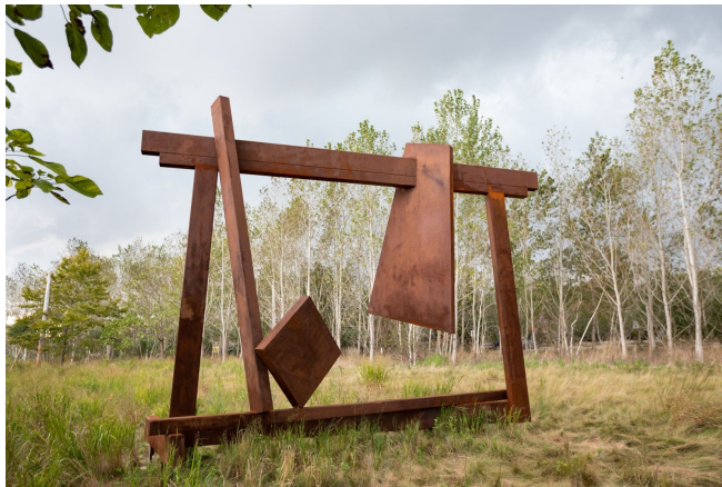
Joel Perlman (American, born 1943) Eastgate , 1989, Welded steel, 180 x 252 x 84 inches, Courtesy of the artist and Loretta Howard Gallery, New York

Sculptures are artworks in 3D (three dimensions)! Sculptures can be made out of stone, wood, clay, metal or any other material the artist wants to use! Lots of artists make sculptures out of scrap or found materials. There are four basic sculpture techniques: carving, casting, modeling and assembling.