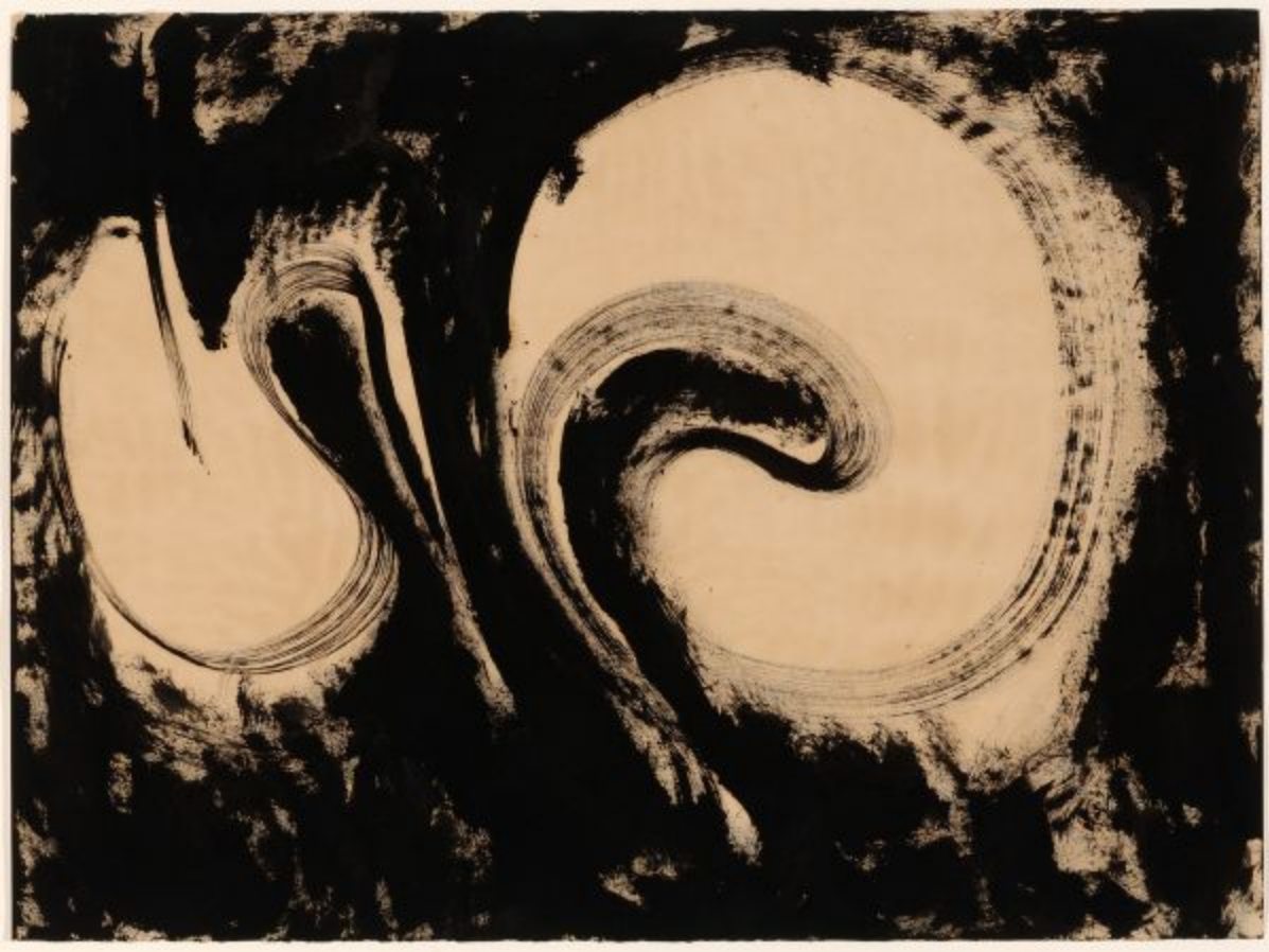
Lee Krasner, American, 1908-1984, Untitled, 1953, Ink on paper, 22 1/2 x 30 inches Parrish Art Museum, Water Mill, N.Y., Anonymous Gift, 1985.1.