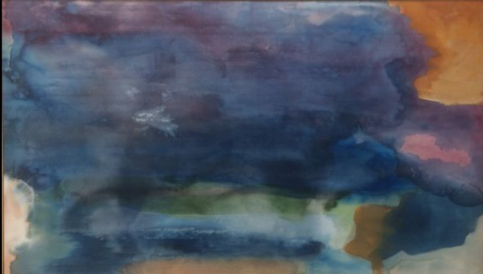
Helen Frankenthaler (American, 1928- 2011), Riverhead, 1963, Acrylic on Canvas, 82 ¼ x 143 inches, Helen Frankenthaler Foundation.