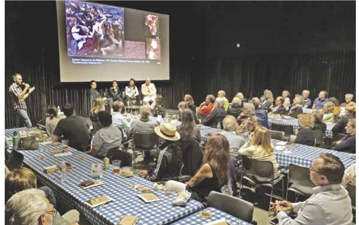
PubSci at the Parrish 2018.