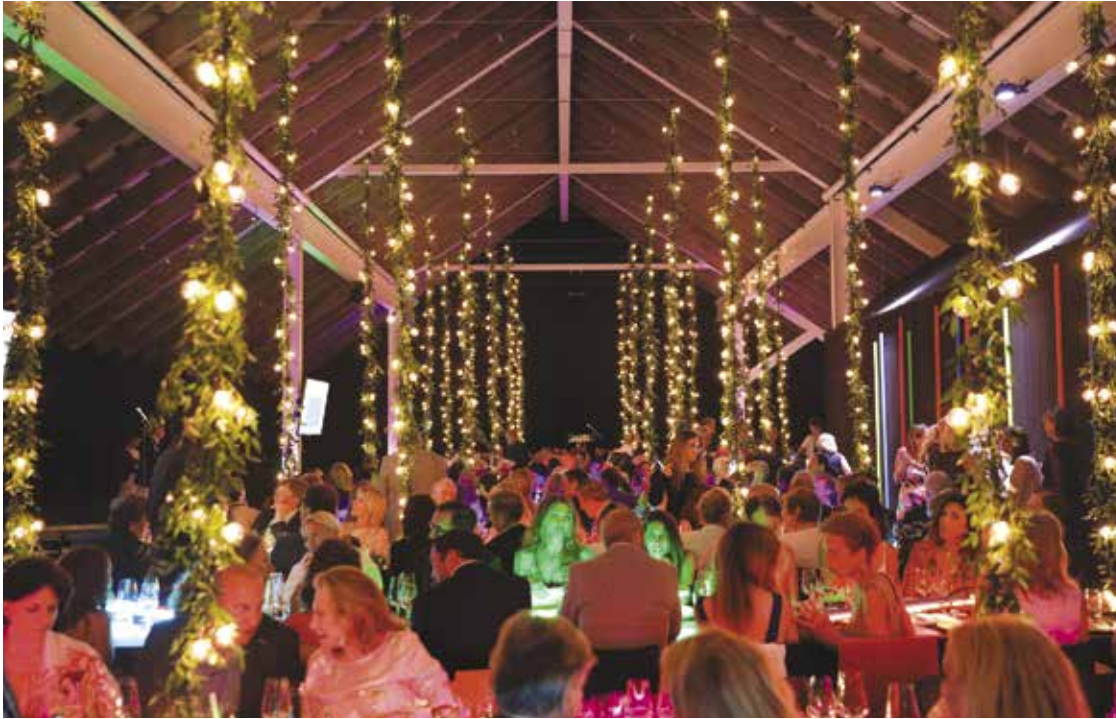
Midsummer Party 2018.