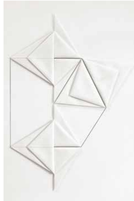
Dorothea Rockburne , Egyptian Painting: Sahura , 1980

Leon Kroll (American, 1884–1974) Child Reading , 1933 Oil on paper, 19 \frac{1}{8} x 27 \frac{1}{8} inches Parrish Art Museum Clark Collection, 1959.6.31