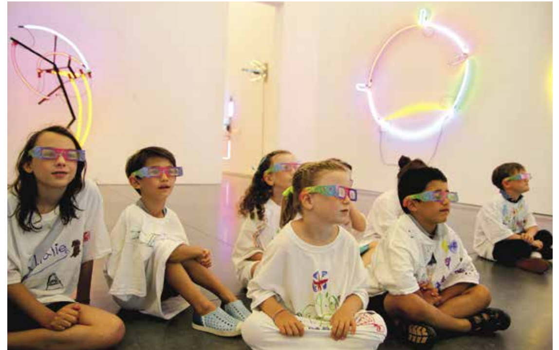
Art Camp.