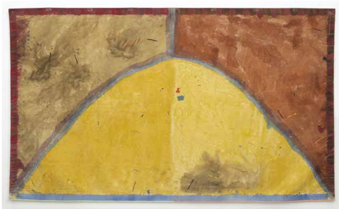
Alan Shields (American, 1944–2005) Where Did That Come From or An Abandoned Golden Aztec, 1971 Acrylic and thread on canvas 84 x 132 inches Parrish Art Museum Gift of Christel Engelbert, 2018.13