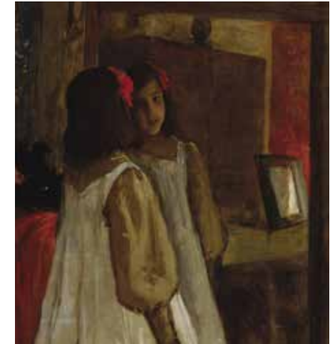
William Merritt Chase , Alice in the Mirror , ca. 1895

Ossip Zadkine , French, 1890–1967 Bathers , 1923 Gouache on paper, 29 x 23 inches Parrish Art Museum Gift of the Betty Parsons Foundation, 1985.3.9