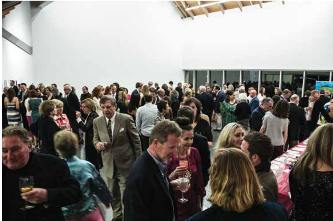
Spring Fling 2014.