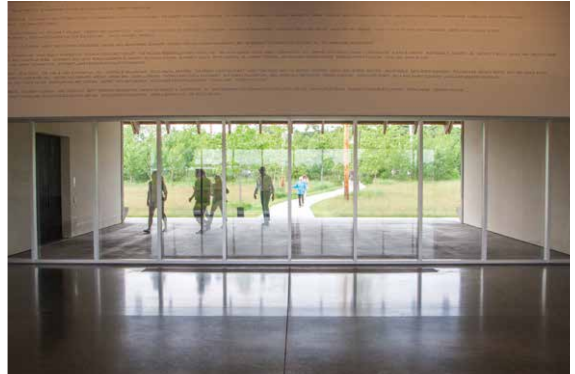
Above: Entrance to the Museum. Below: Parrish Contemporaries Circle Members visit artist Eric Fischl's studio in Sag Harbor, N.Y.