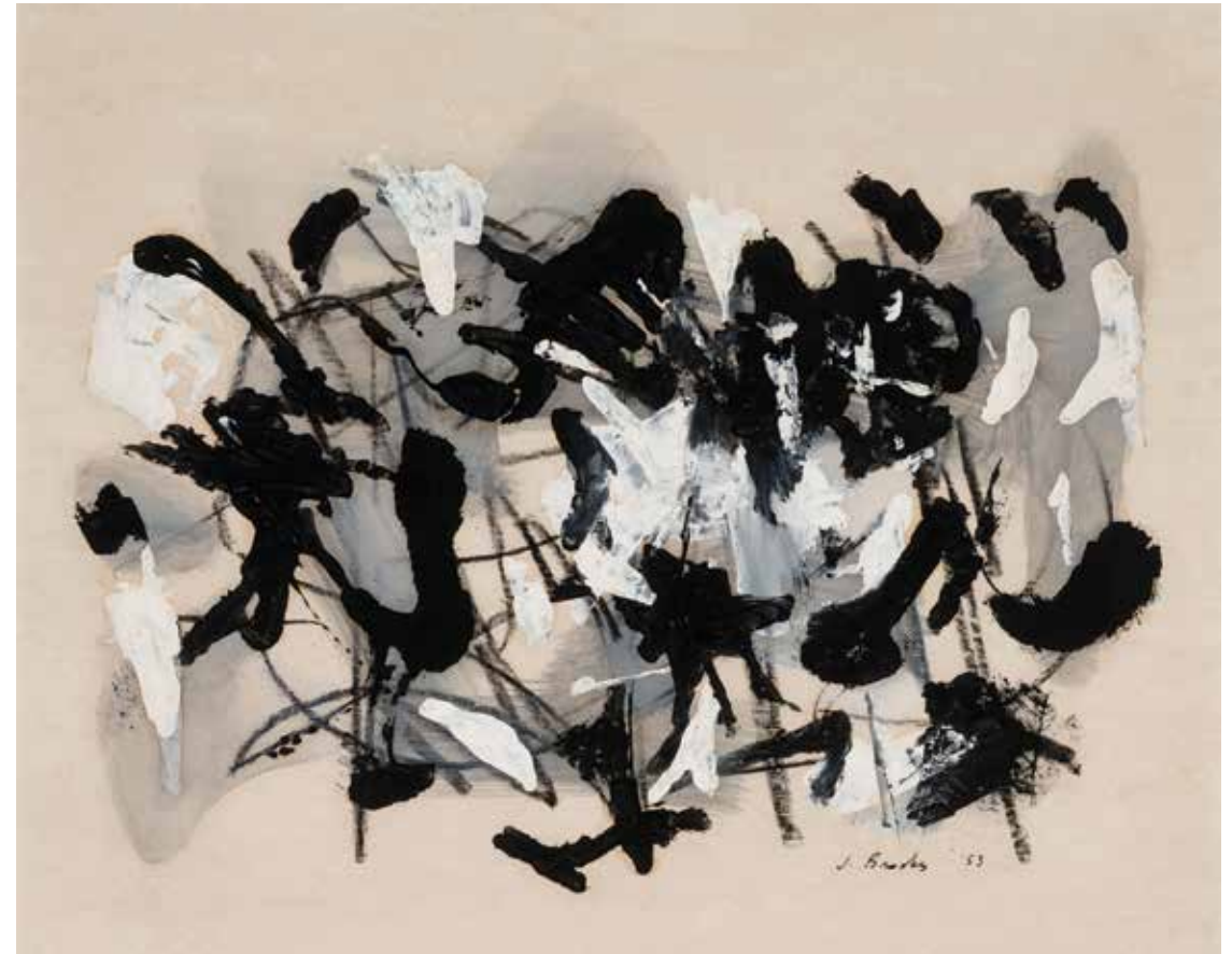
James Brooks , Untitled , 1953