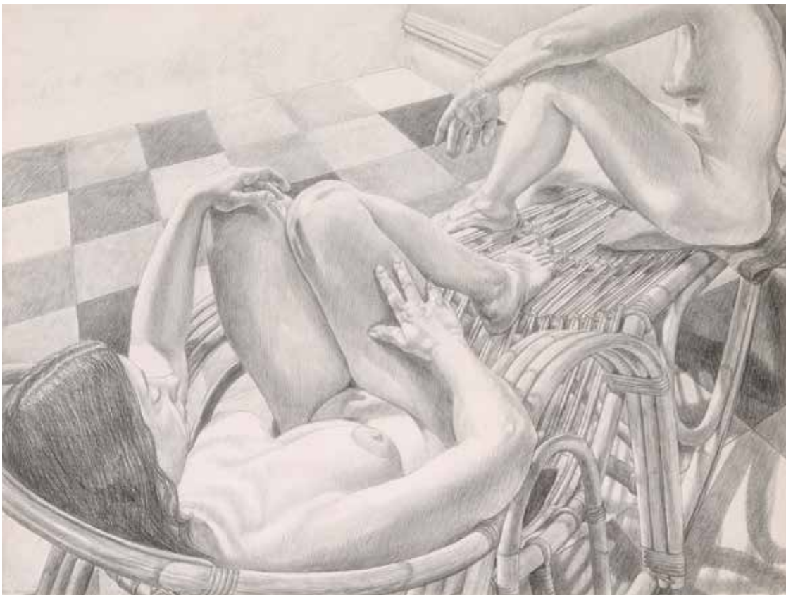
Phillip Pearlstein, Two Nudes on a Bamboo Recliner and Linoleum , 1984

The Parrish is a center for cultural engagement, an inspiration and destination for the region, the nation, and the world.