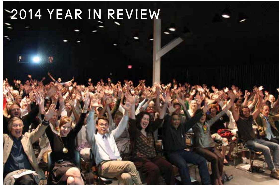
PechaKucha audience in the Lichtenstein Theater.