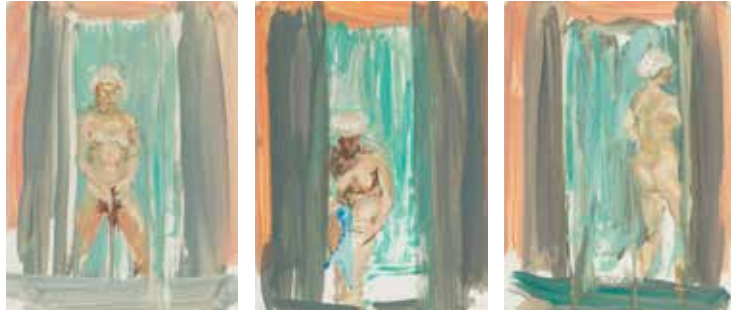
Eric Fischl, Untitled (Woman in Shower) , 1984