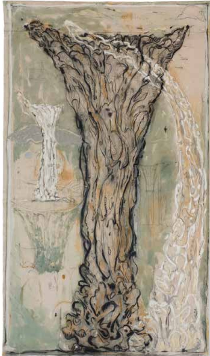
Bryan Hunt, Veil Falls , 2005

James Brooks (American, 1906–1992), Comac , 1960. Lithograph, 28 ¼ x 20 ¼ in. Gift of the James and Charlotte Brooks Foundation.