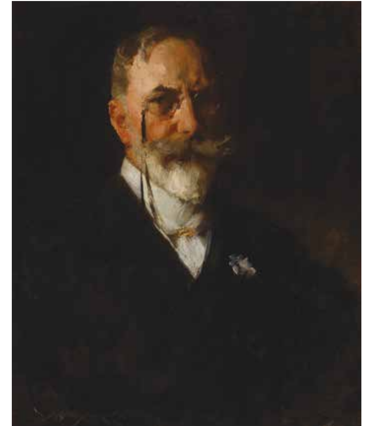
William Merritt Chase, Self-Portrait , 1913

Ry Rocklen (American, b. 1978), Trophy Modern , 2013. Plastic trophy, trophy parts, and painted wood with lighting element, 10 ¾ x 9 x 6 in. Gift of an anonymous donor.