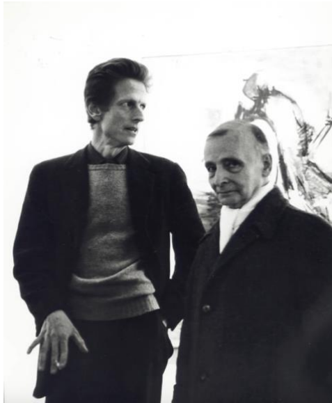
David Hare and Frederick Kiesler, 1959