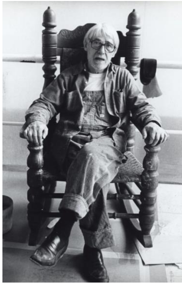
Willem de Kooning, East Hampton, 1978