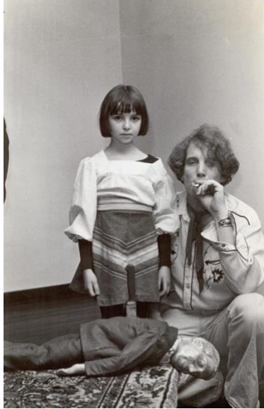
Dennis Oppenheim, Search for Clues, ca 1976