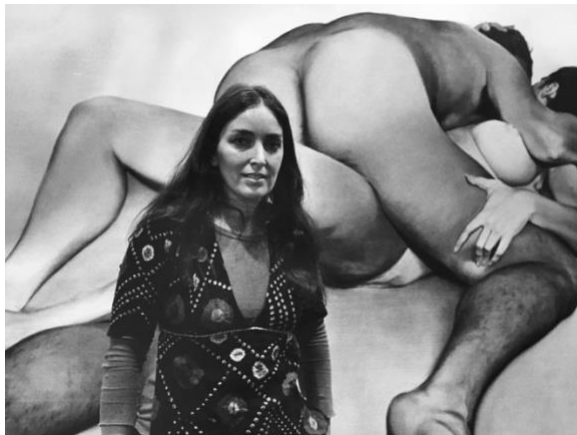
Joan Semmel, ca 1970