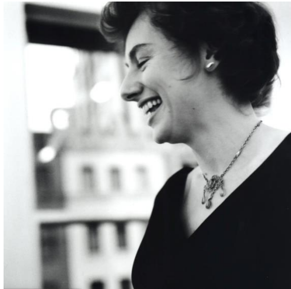
Grace Hartigan, 28 April 1959