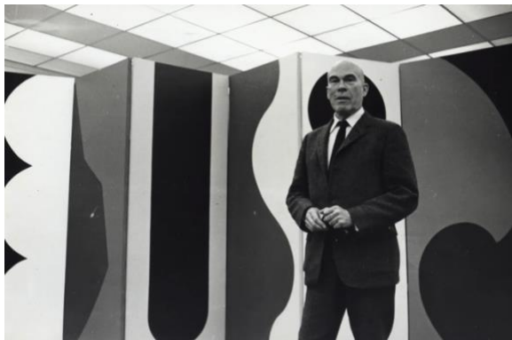
Leon Polk Smith, ca 1965