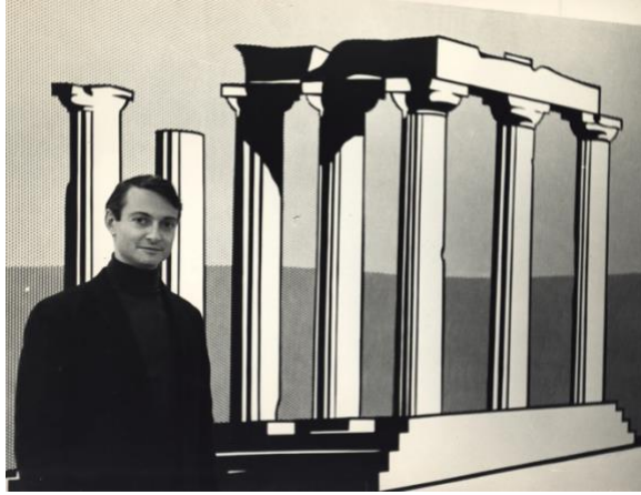
Roy Lichtenstein at Leo Castelli Gallery, 1964