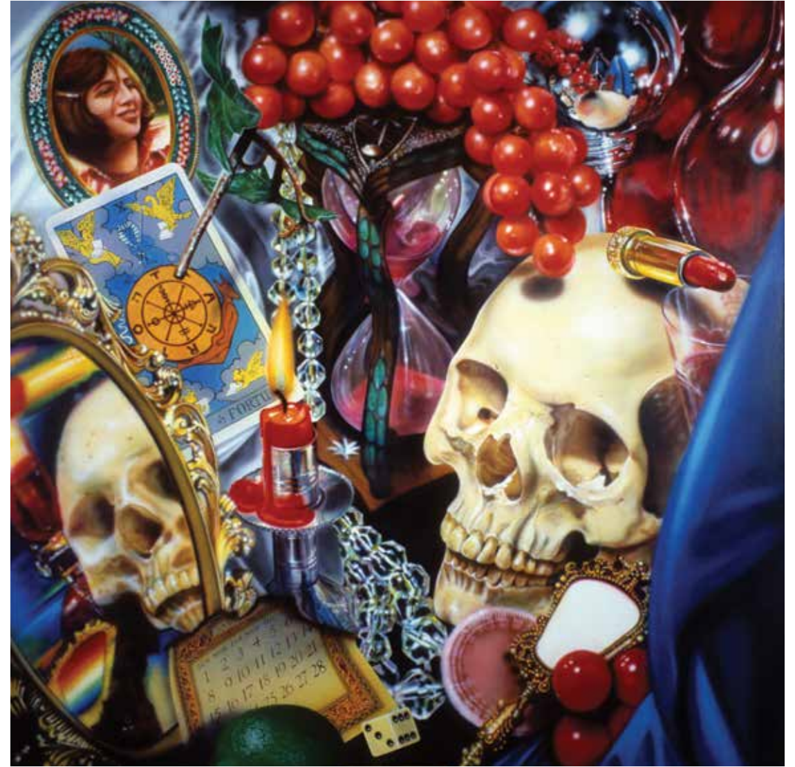
Audrey Flack, Wheel of Fortune , 1977–1978.

William Merritt Chase (American, 1849–1916) The Pot Hunter (The Road through the Fields; The Hunter) , ca. 1894 Oil on canvas, 16¼ x 24¾ inches Parrish Art Museum Purchase Fund and Gift of Mr. Frank Sherer, 1974.5