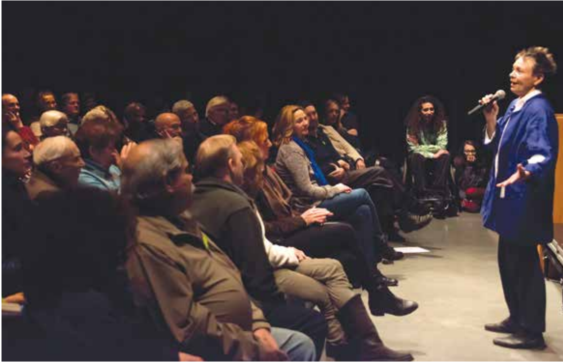
Laurie Anderson at the screening of Heart of a Dog.