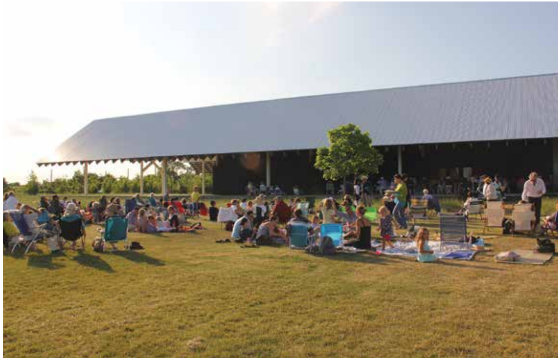
Friday Night program Jazz en Plein Air