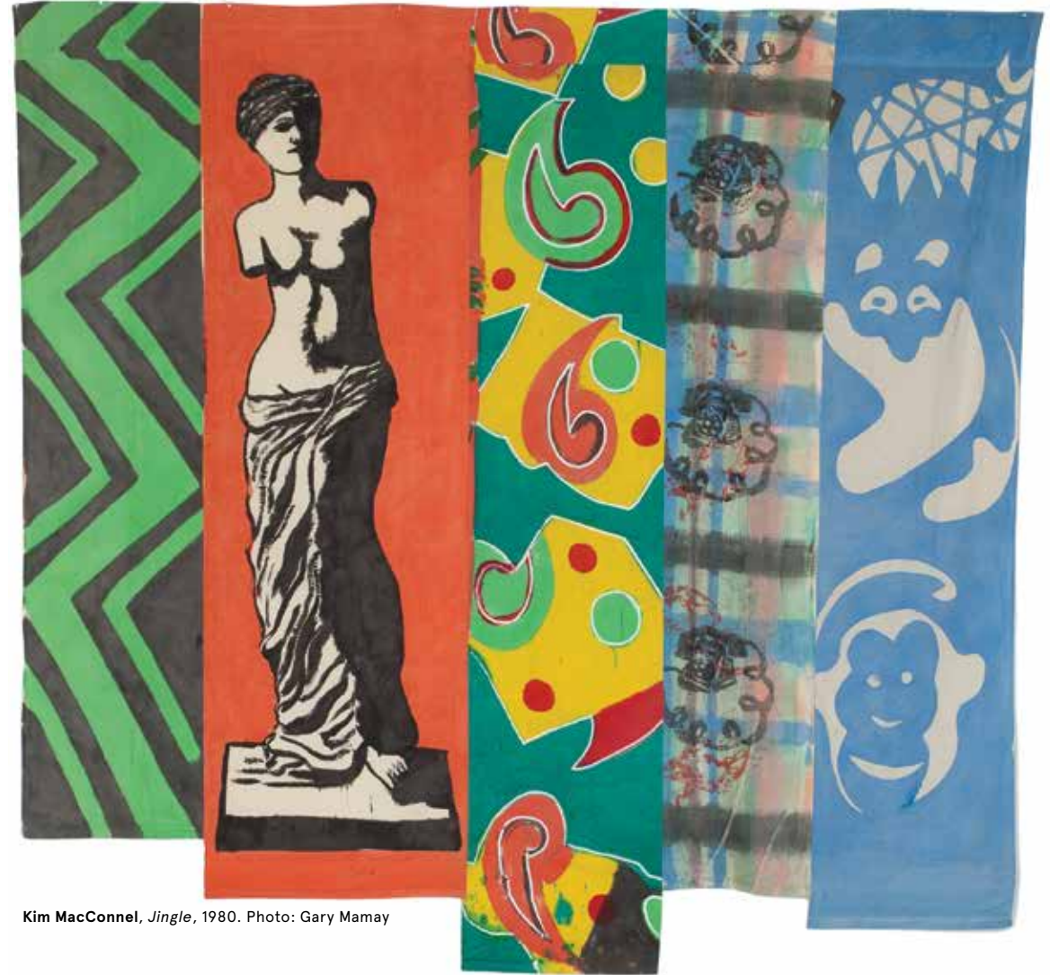
Kim MacConnel, Jingle , 1980.

Joseph Stella (American, born Italy, 1877–1946) Untitled (Iris) , ca. 1920 Colored pencil and pencil on paper 10 5/8 x 7 3/4 inches Gift of Jack W.C. Hagstrom, M.D.