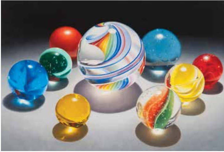
Charles Bell, Kandy Kane Rainbow , 1994.

Paul Cadmus (American, 1904–1999) Male Nude , 1991 Watercolor, charcoal, and pastel on paper, 19 7/8 x 25 7/8 inches Gift of Beverly and Steve Ehrlich and Family