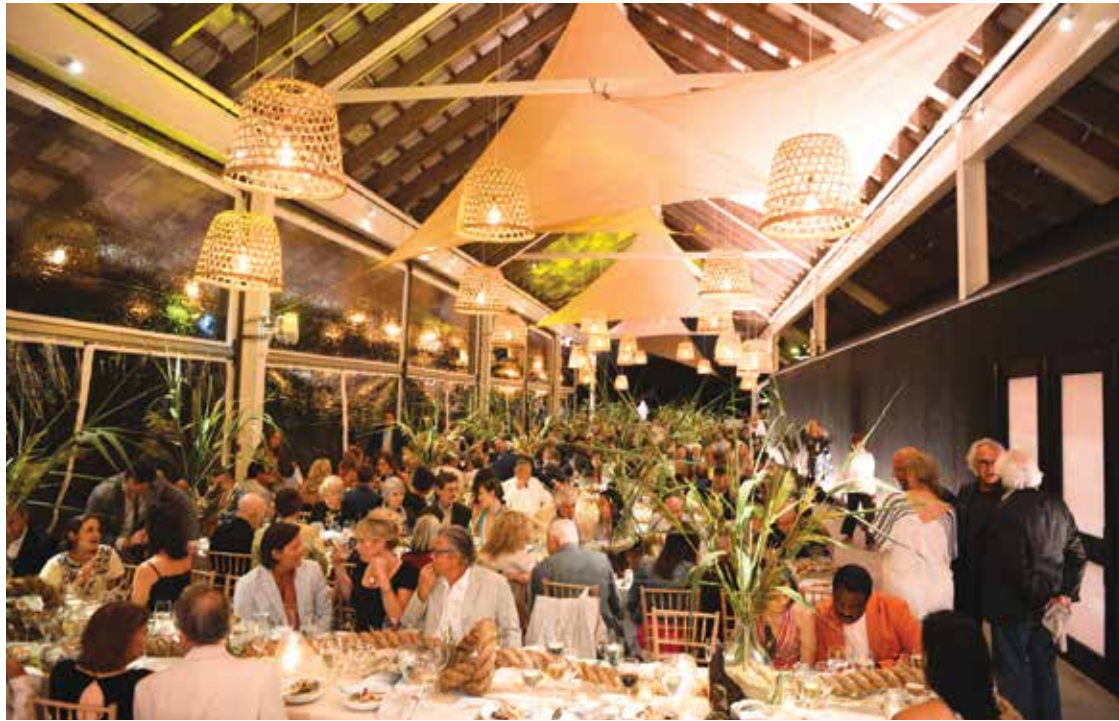
2016 Midsummer Party.