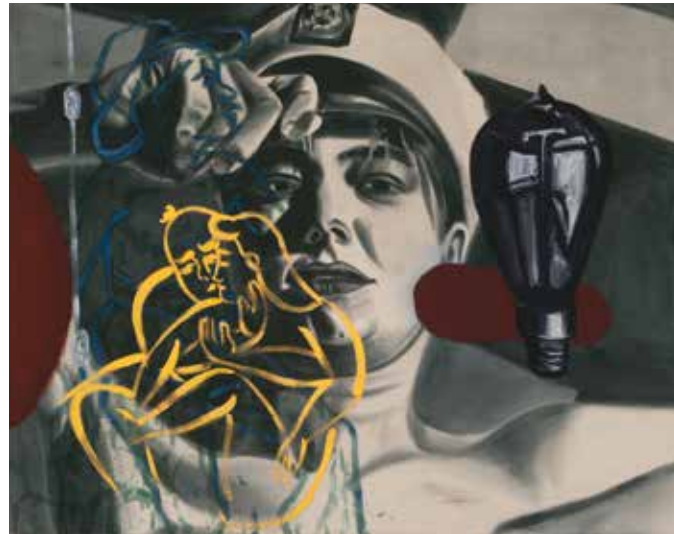
David Salle, The Sailor Cap , 1986