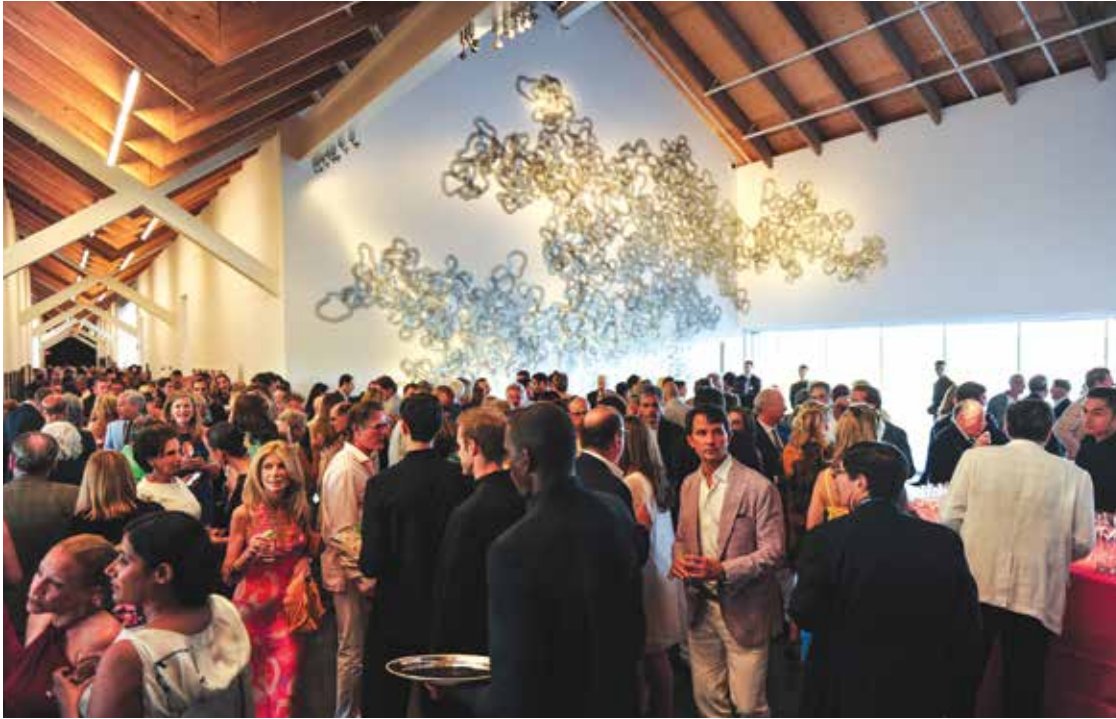
2015 Midsummer Party.