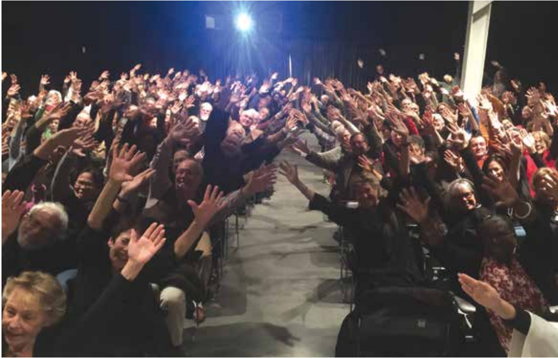
Above: PechaKucha Night Hamptons audience.