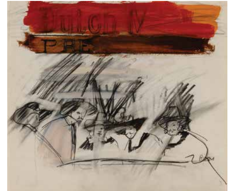
Larry Rivers, Untitled (Dutch Masters) , ca. 1962