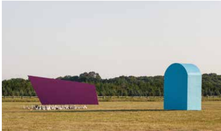
LEFT: PARRISH ROAD SHOW Tucker Marder (American, born 1989) Stampede , 2015 Parrish Road Show 2015 Water Mill, NY