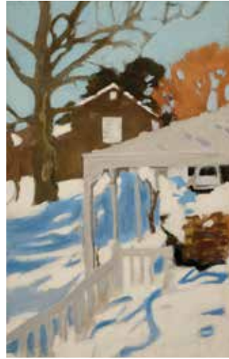
Above: William Merritt Chase , Shinnecock Landscape , ca. 1953. Above, right: Fairfield Porter , View Towards the Studio , 1967